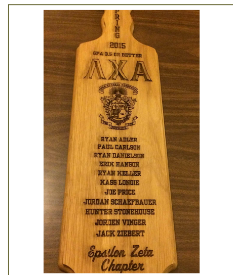
Spring 2015 Academic All-Stars

With the addition of 11 new members, who had high GPAs their senior year of high school, I have no doubt that they will contribute to our house GPA and help us improve academically for the years to come