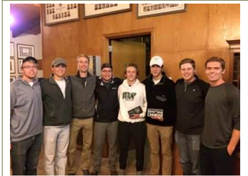
Some of our newest brothers along with their big brothers