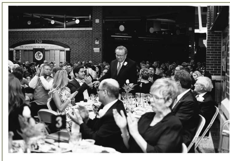
Group and program photos from the Homecoming 2015 Banquet

reminiscing and creating new memories with Lambda Chi's old and new.