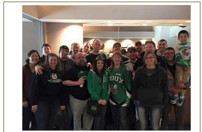
Last year's Minneapolis NCHC Tournament Alumni Gathering