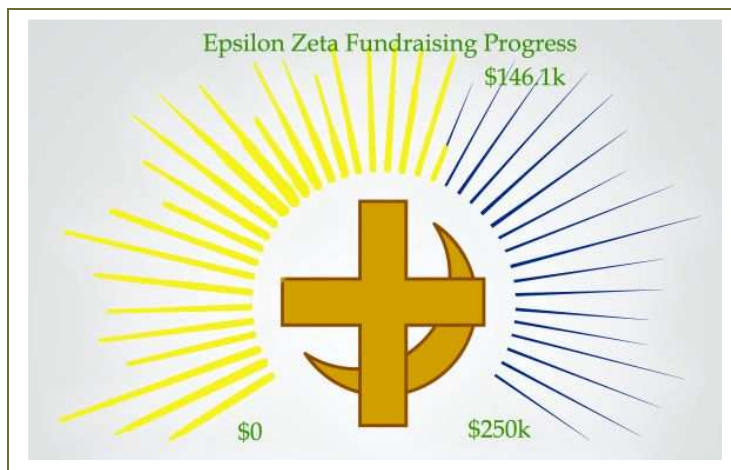
Fundraising status graphic

Epsilon-Zeta is still in need of financial assistance from our generous alumni to keep things moving in the right direction for our chapter. We are currently raising funds for: on-going maintenance and bringing chapter house up to date after many years of use, paying down outstanding debts (late '90's flood repairs – furnaces, recent bathroom remodeling), scholarships and increasing the House Corp reserve fund. We have set a goal of raising $250k to move our chapter to new heights in the coming years and ensure our long-term success. 2013–2015 YTD fundraising is at ~$146.1k as of this writing. We are making great progress!!